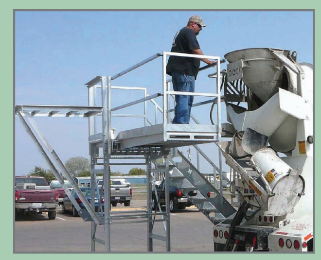
Single Slump Master III with Optional Pallet Rack

Compact Shipping - ships Motor Freight Lightweight Fiberglass Decking & Stairs Single and Double Units both utilize only one tower