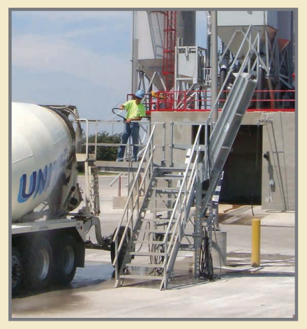
Double Slump Master III